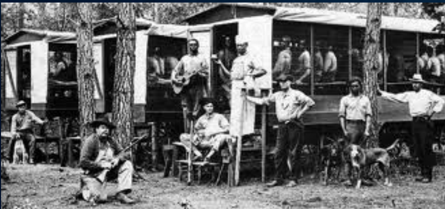
Black families after the Civil War and during the Reconstruction era